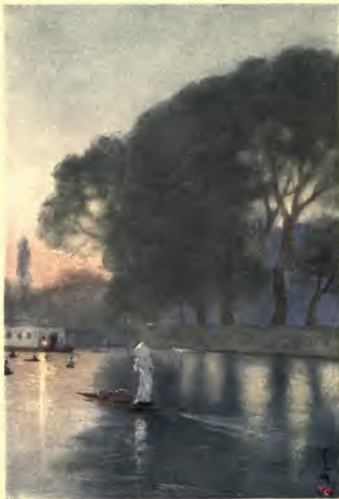
PUNTING ON THE THAMES.